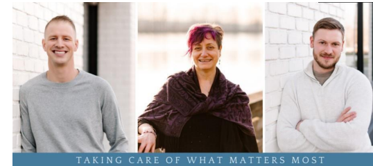
TAKING CARE OF WHAT MATTERS MOST