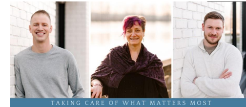
TAKING CARE OF WHAT MATTERS MOST