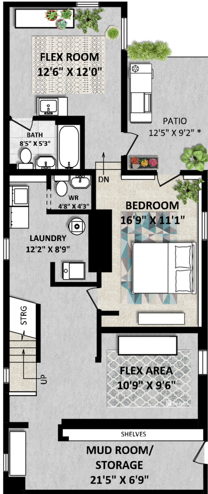
LOWER FLOOR: 1041 SQ.FT.

**INCLUDES 66 SQ.FT. OF LOW CEILING AREA(S), BOUND BY DOTTED LINES.