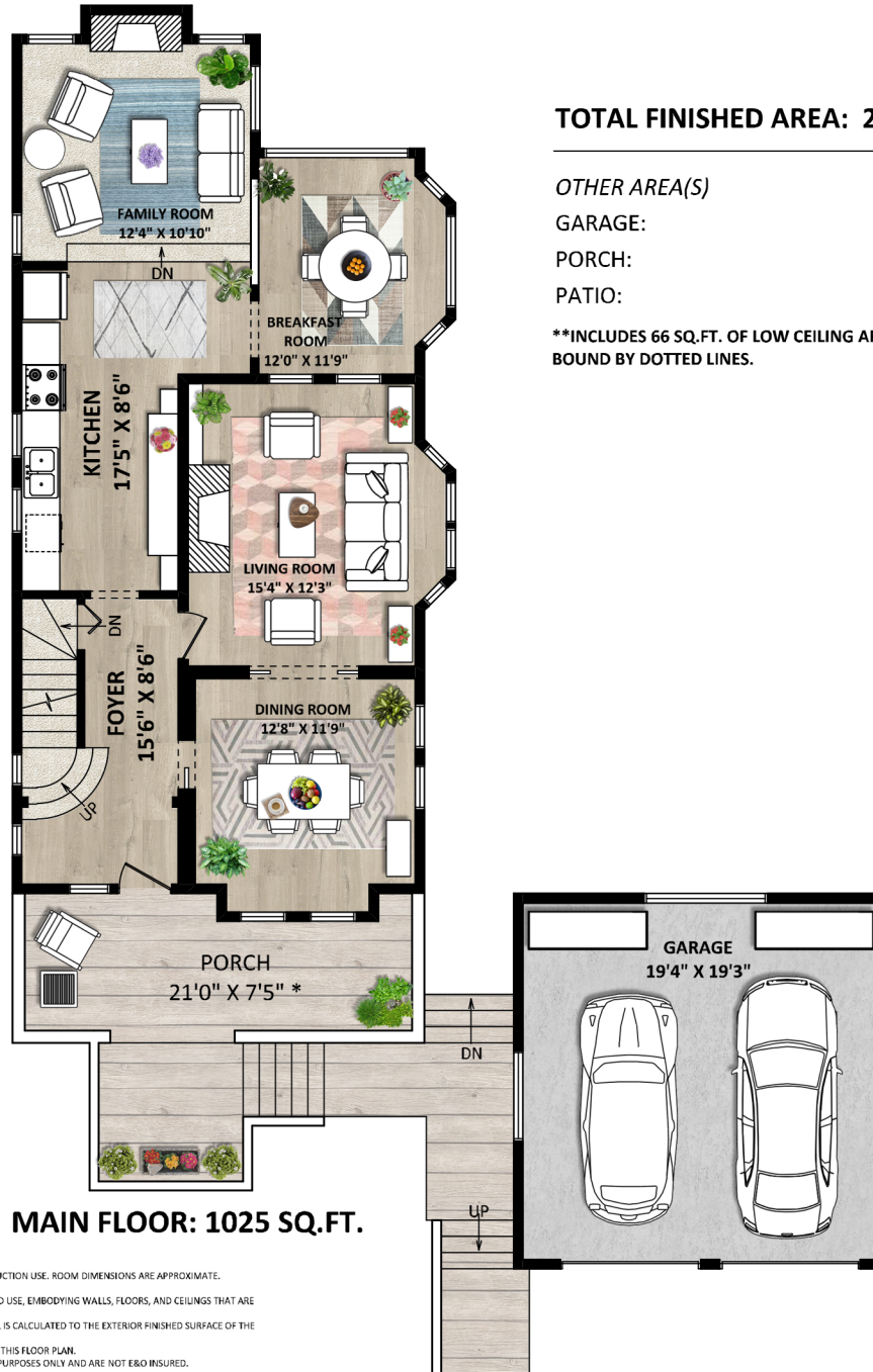
MAIN FLOOR: 1025 SQ.FT.