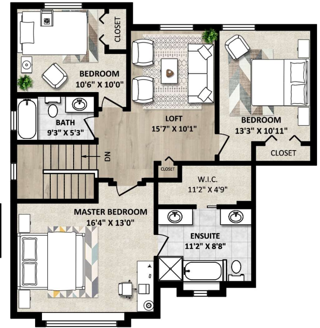
UPPER FLOOR: 1127 SQ.FT.