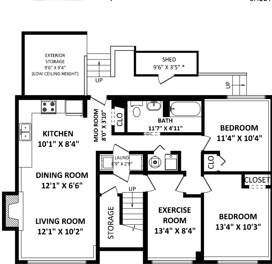
LOWER FLOOR: 1040 SQ.FT.