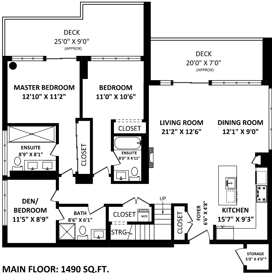
MAIN FLOOR: 1490 SQ.FT.

DECK: 365 SQ.FT.* ROOF DECK: 1600 SQ.FT.* STORAGES: 70 SQ.FT.*