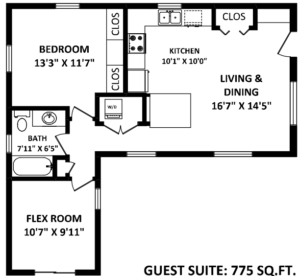
GUEST SUITE: 775 SQ.FT.