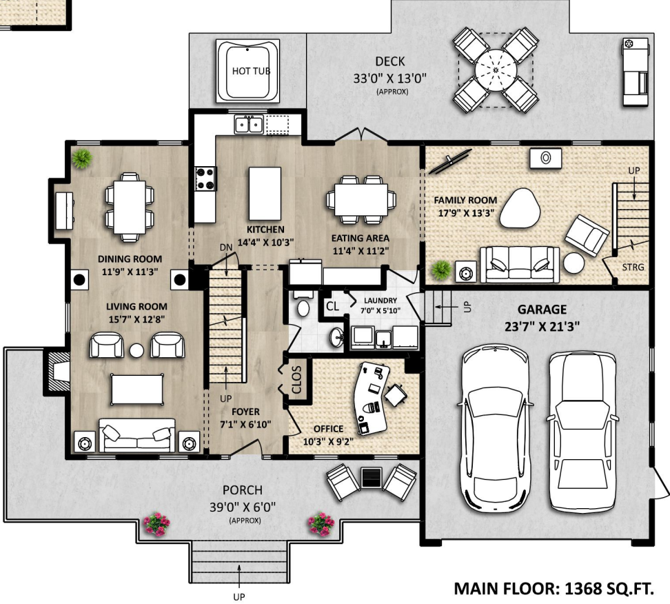
MAIN FLOOR: 1368 SQ.FT.