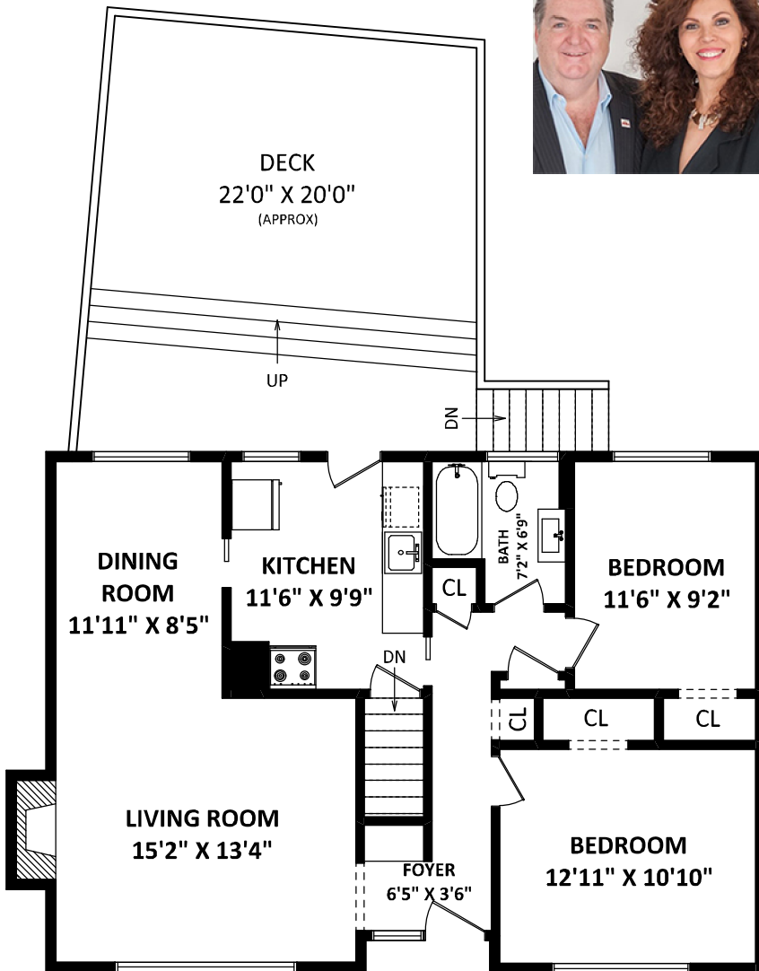
MAIN FLOOR: 945 SQ.FT.