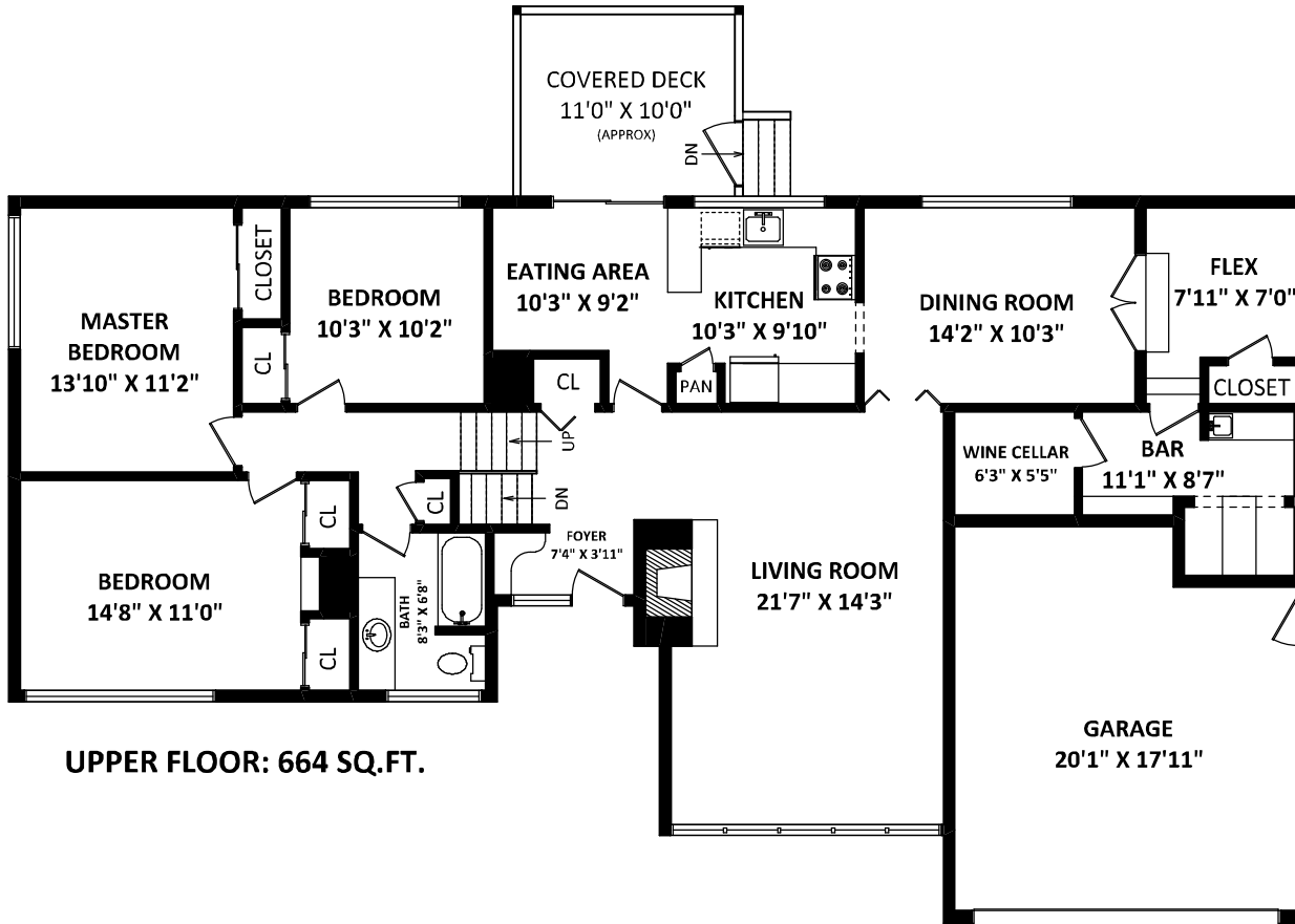
UPPER FLOOR: 664 SQ.FT.

3630 Delbrook Avenue, North Vancouver, BC