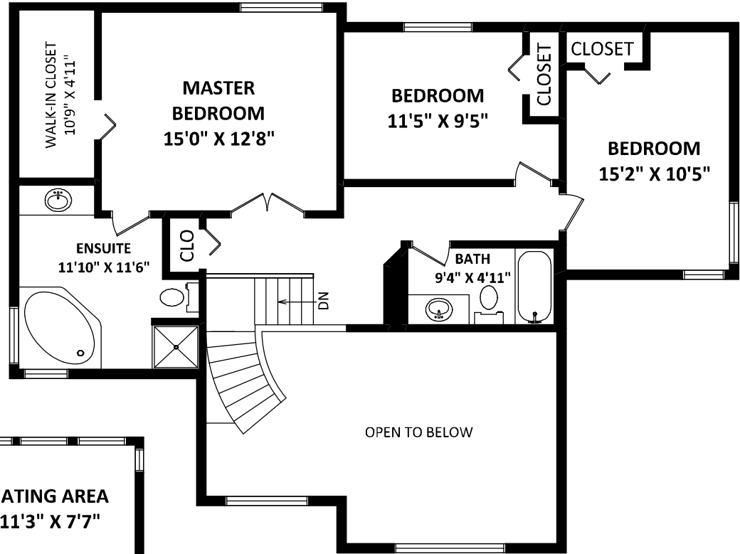
UPPER FLOOR: 962 SQ.FT.