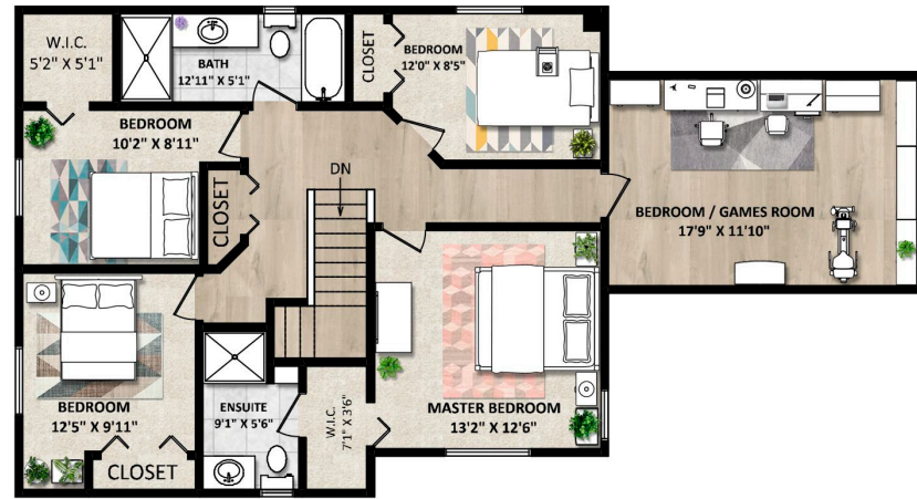
UPPER FLOOR: 1154 SQ.FT.