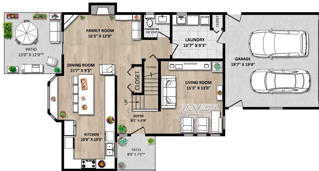
MAIN FLOOR: 986 SQ.FT.