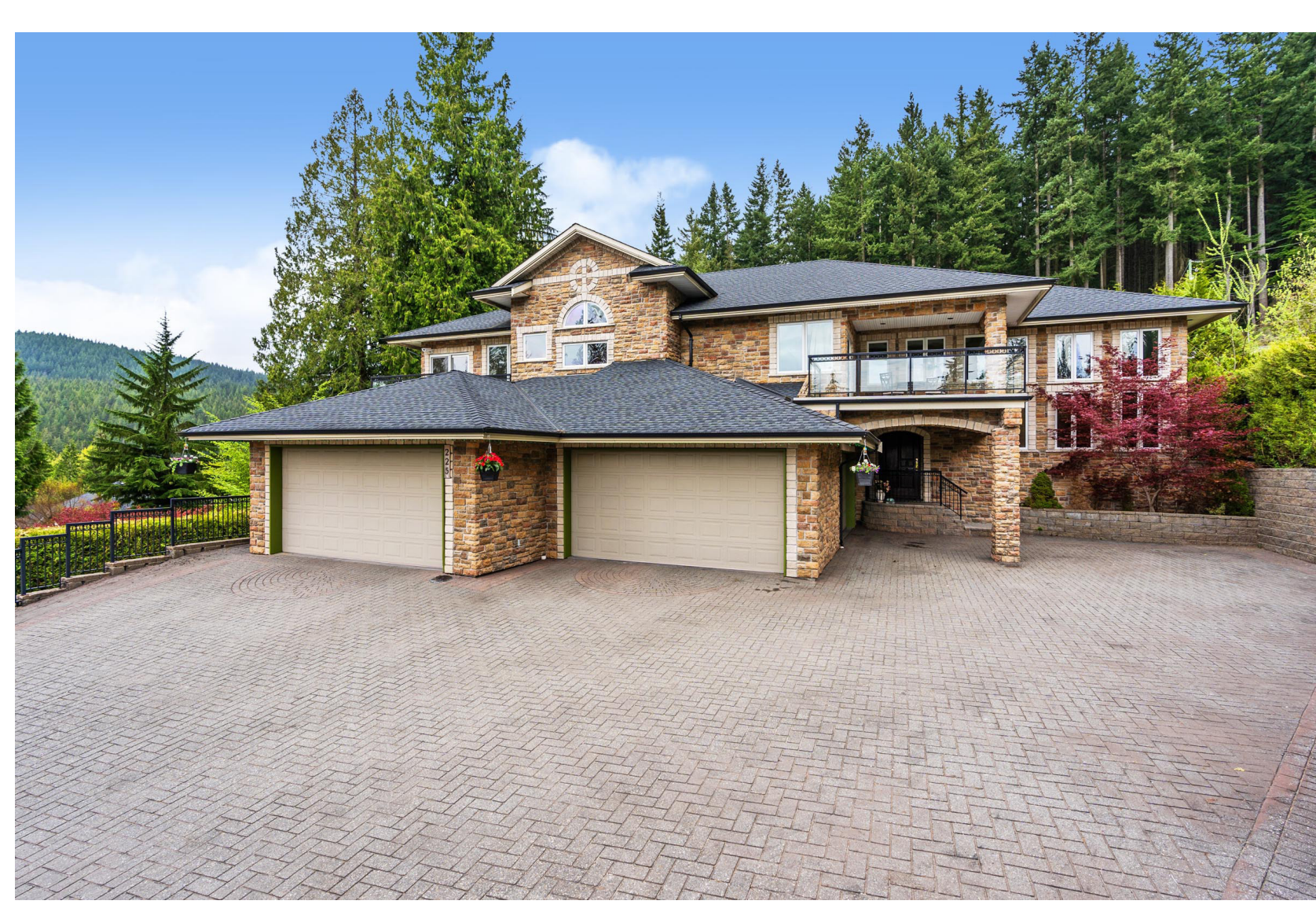
225 ALPINE DRIVE ANMORE