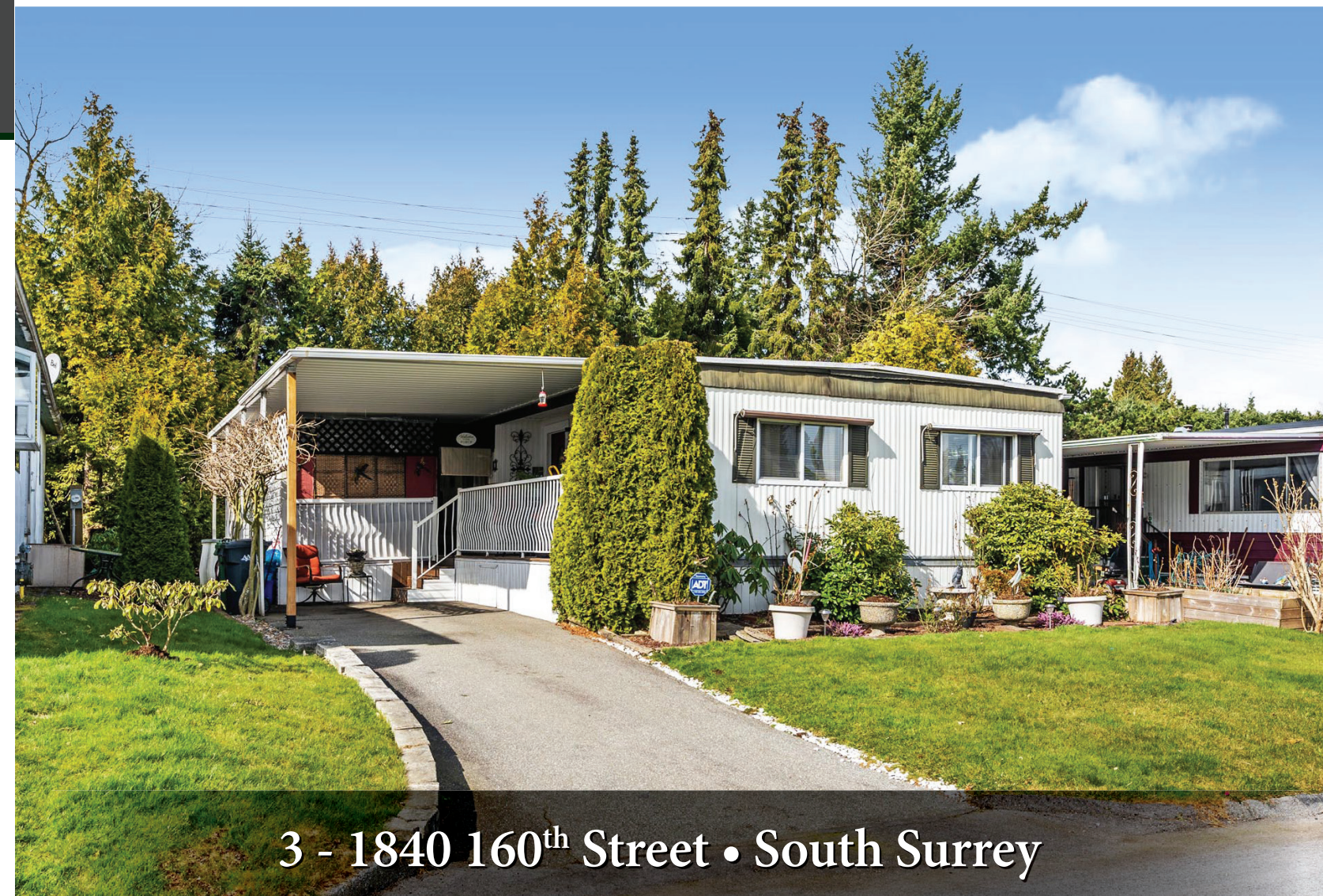
3 - 1840 160 th Street • South Surrey