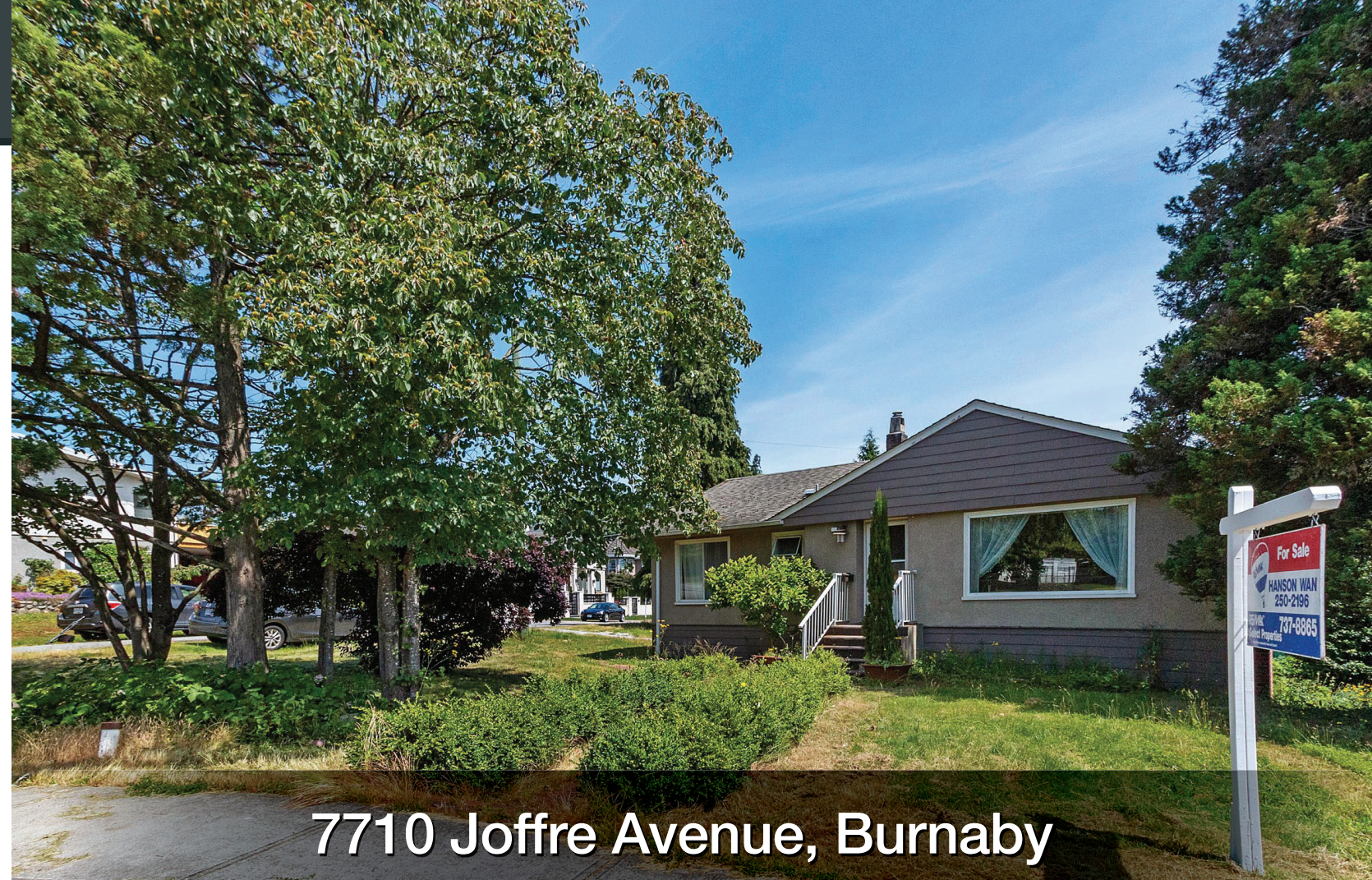
7710 Joffre Avenue, Burnaby