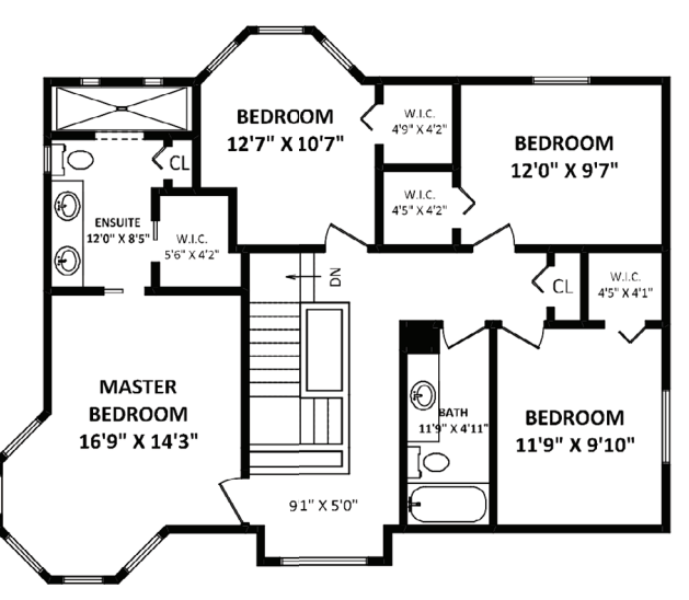
UPPER FLOOR: 1068 SQ.FT.