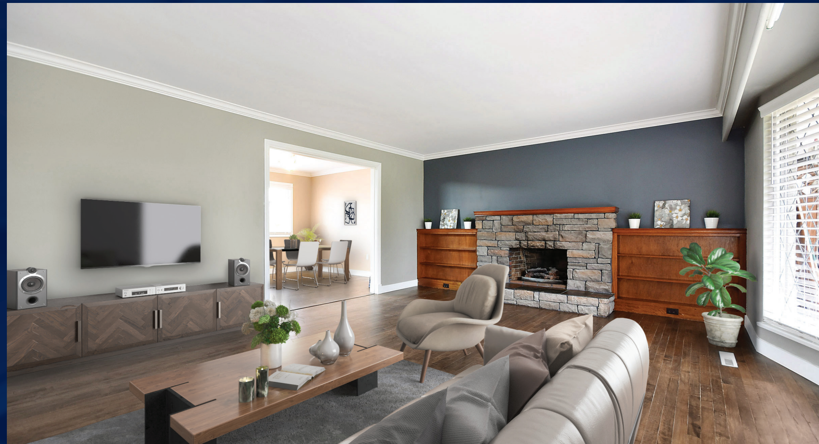
MAIN FLOOR: 721 SQ.FT.