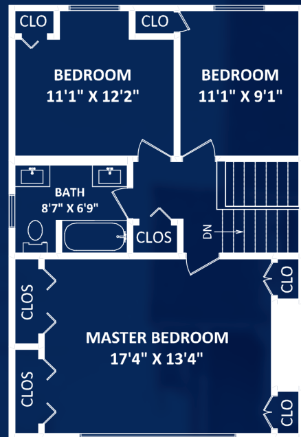
UPPER FLOOR: 744 SQ.FT.