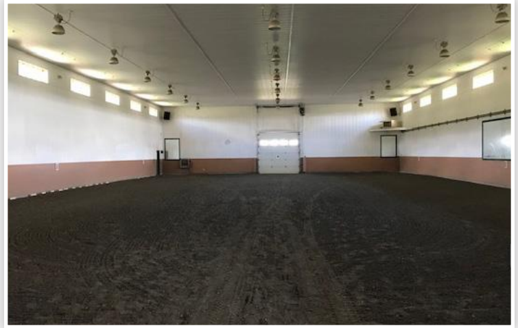
11,000 square feet.

Included is: Veterinarian Facility, 3 bathrooms, mechanical room, kitchen, upper viewing deck, PA System, alarm system, electric and boiler heat.