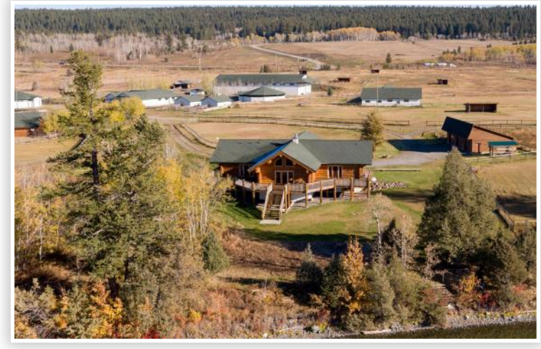
Private 1400 feet of your luxurious lakefront run along one of the largest Lac La Hache properties. Property is fully fenced and is equipped to be a first class Equestrian Facility along with excellent revenue with 16 rooms to be used as a entrepreneurs dream business.