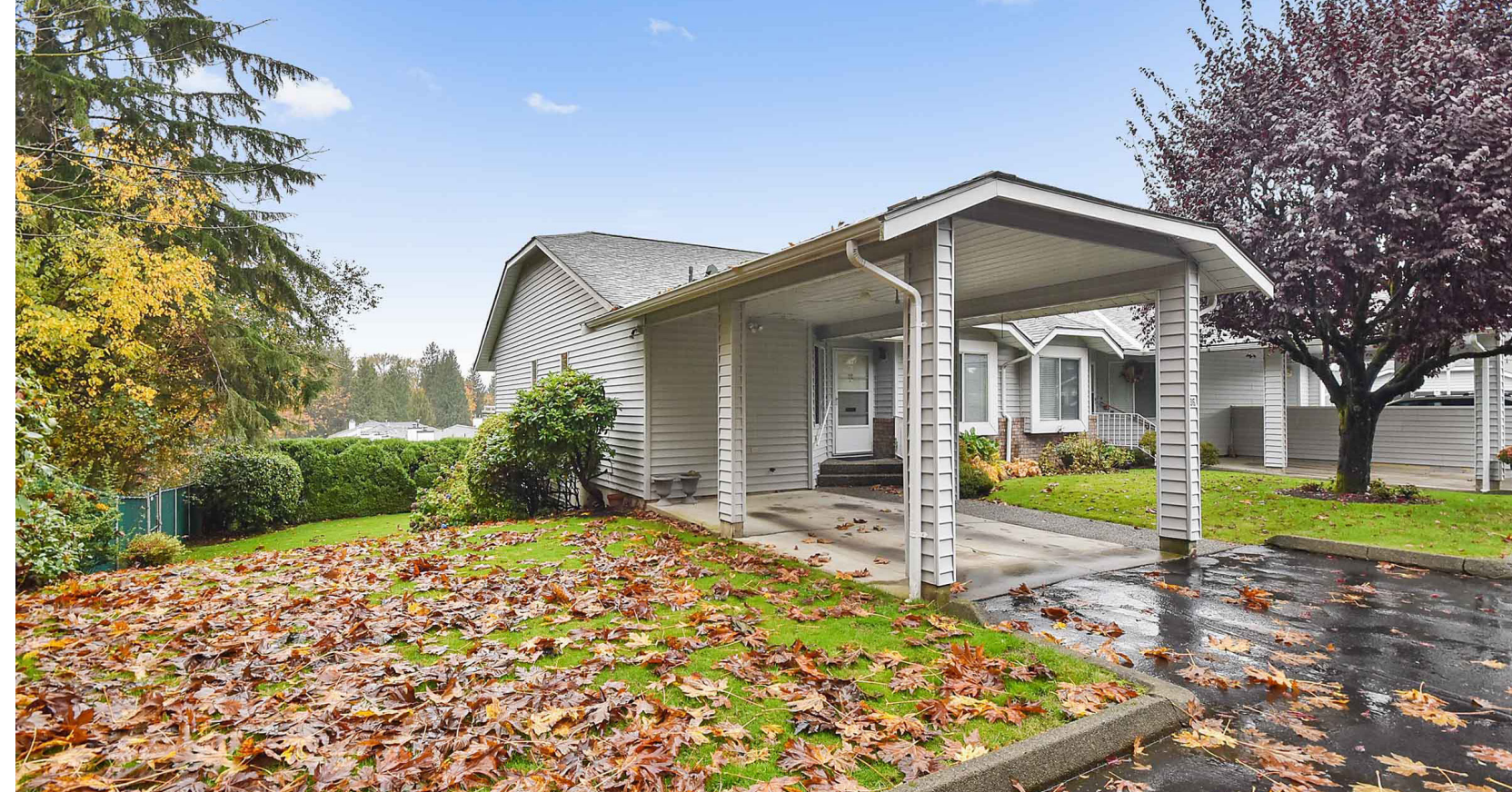
36 2989 Trafalgar St - Abbotsford