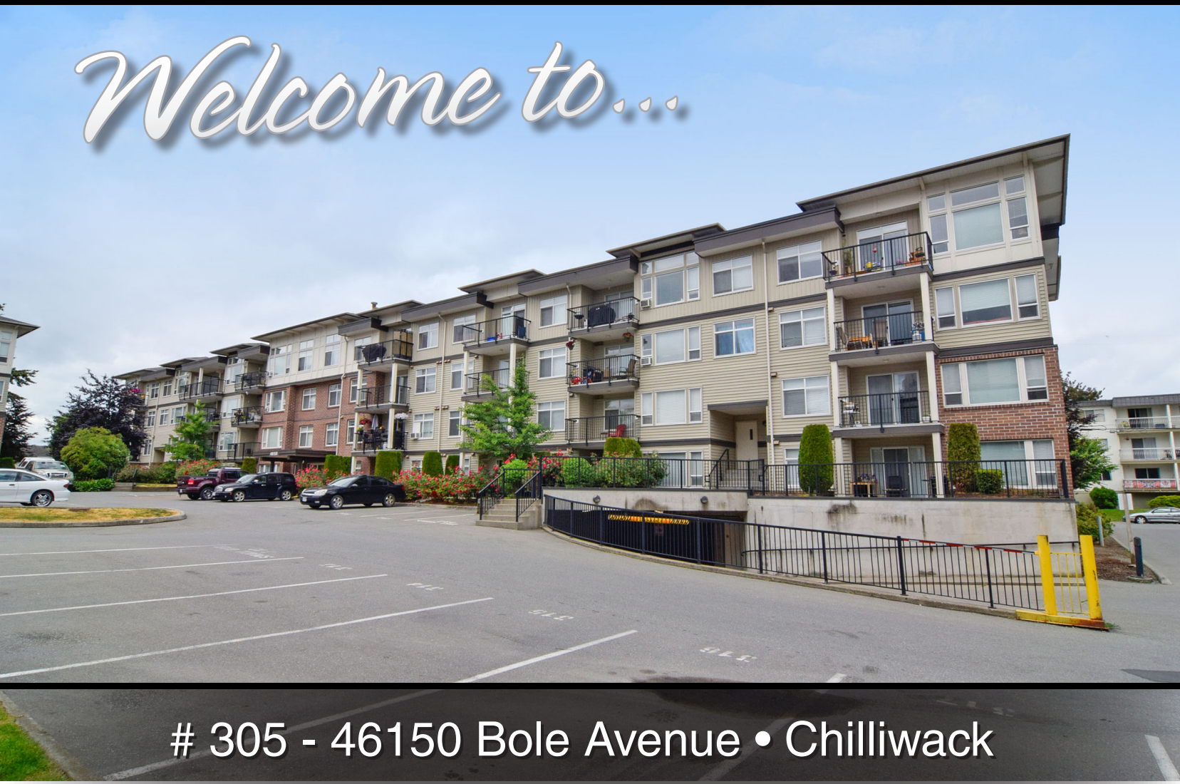
# 305 - 46150 Bole Avenue • Chilliwack

Bold with POSSIBILITIES Joyed with OPPORTUNITIES Ethical with RESPONSIBILITIES Transparent with DEALINGS Aware of PROCEEDINGS Noted for HIGH MORAL BEARINGS