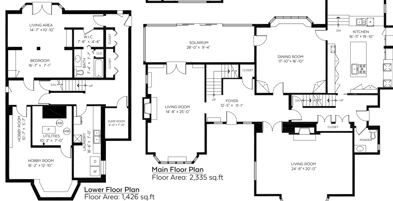
Lower Floor Plan Floor Area: 1,426 sq.ft.