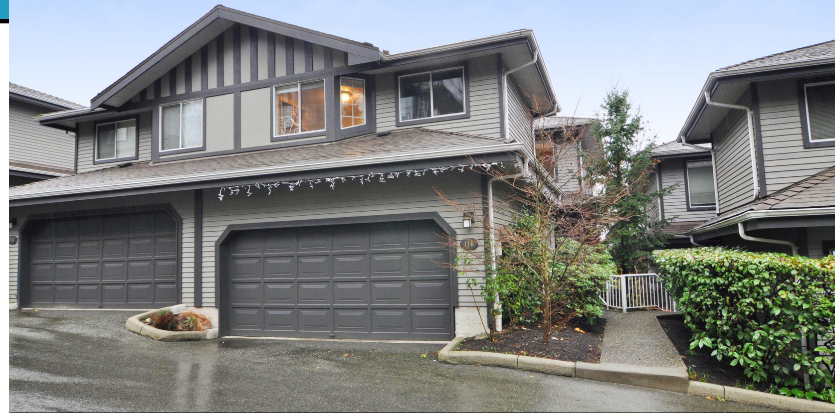
#116 2998 Robson Drive, Coquitlam