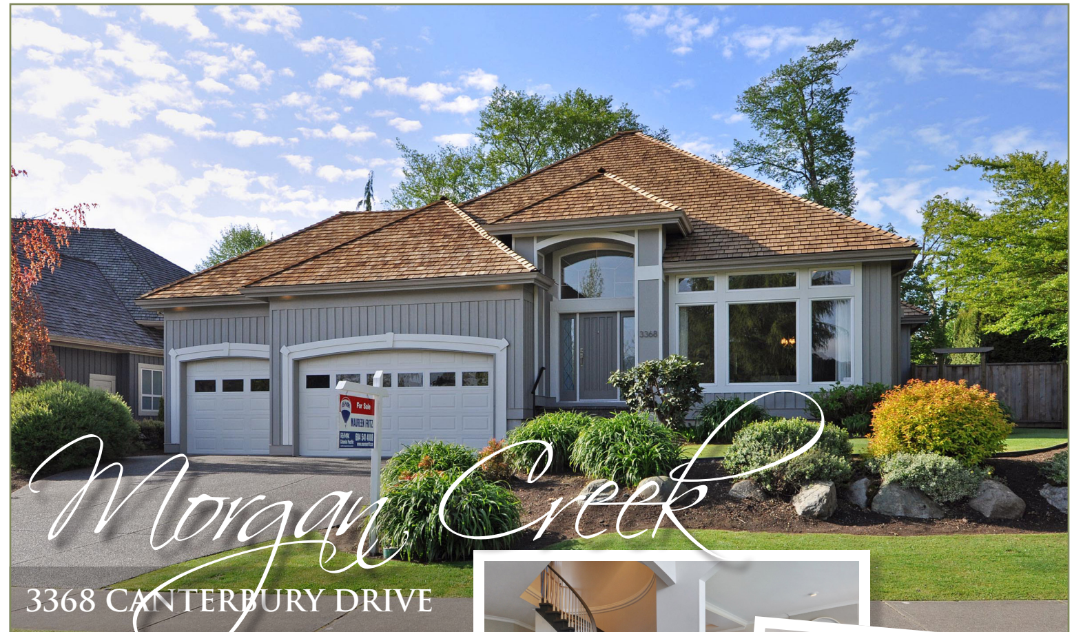
3368 CANTERBURY DRIVE

MORGAN CREEK Executive 5022 sf luxury home backing on protected green space. Large private south facing 13,166sf lot. This home has been completely renovated and beautifully maintained with brand new hardwood flooring and carpeting.