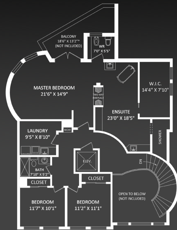
UPPER FLOOR: 1676 SQ. FT.

(NOT INCLUDING DECK, PATIO & BALCONY) *APPROXIMATE MEASUREMENTS