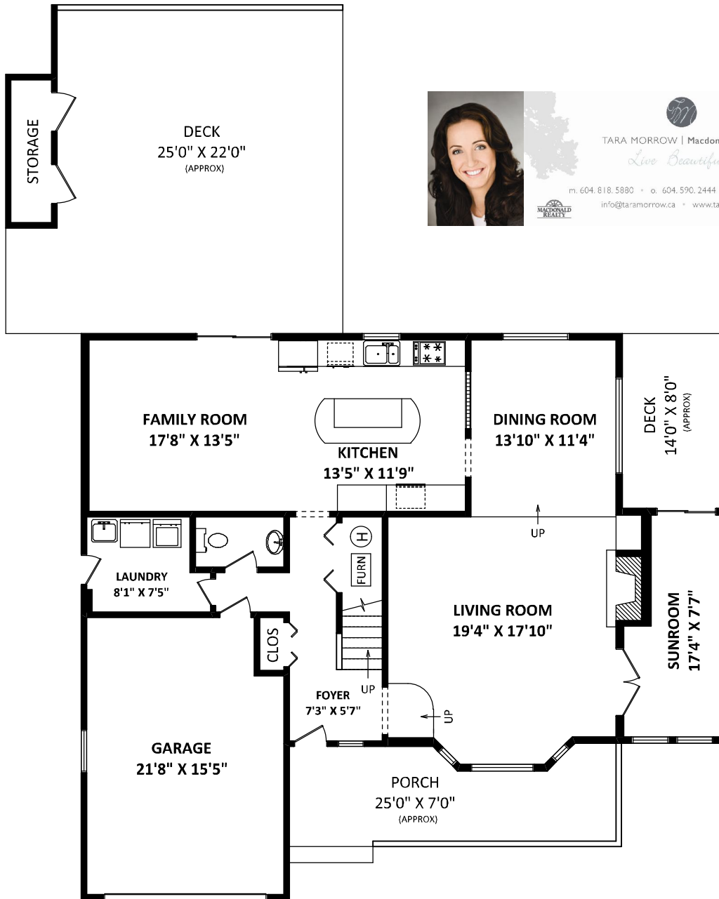
MAIN FLOOR: 1380 SQ.FT.