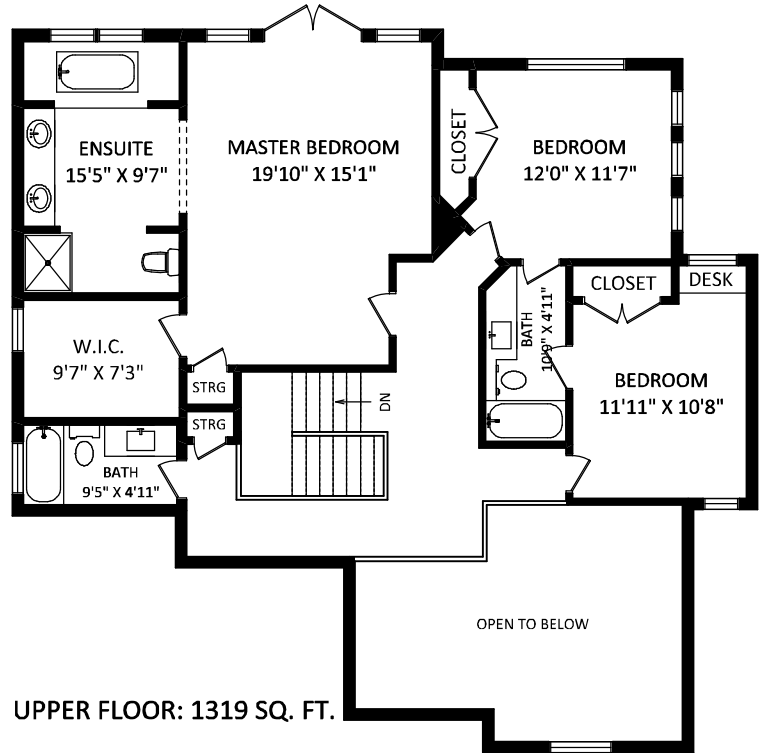
UPPER FLOOR: 1319 SQ. FT.